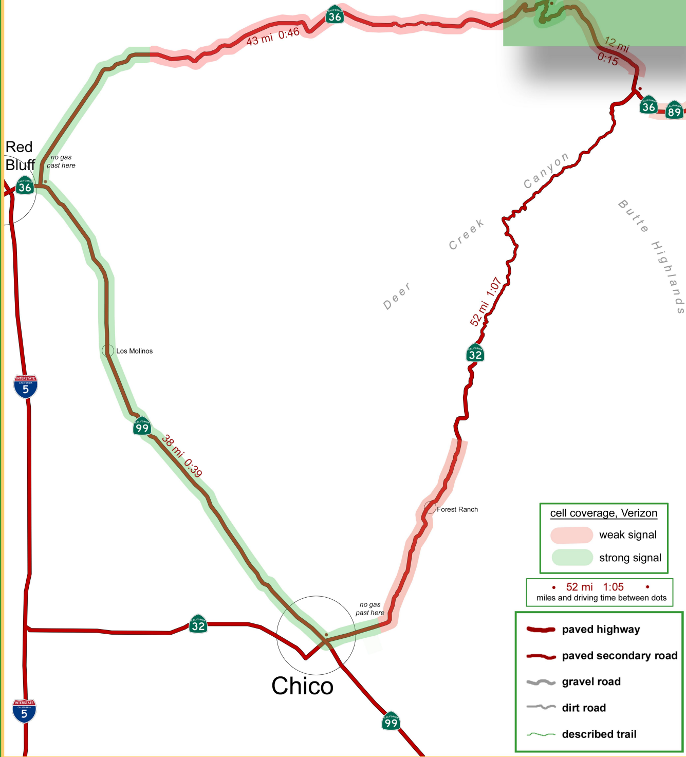
Conard Meadows shuttle ▪ Map 1 of 3