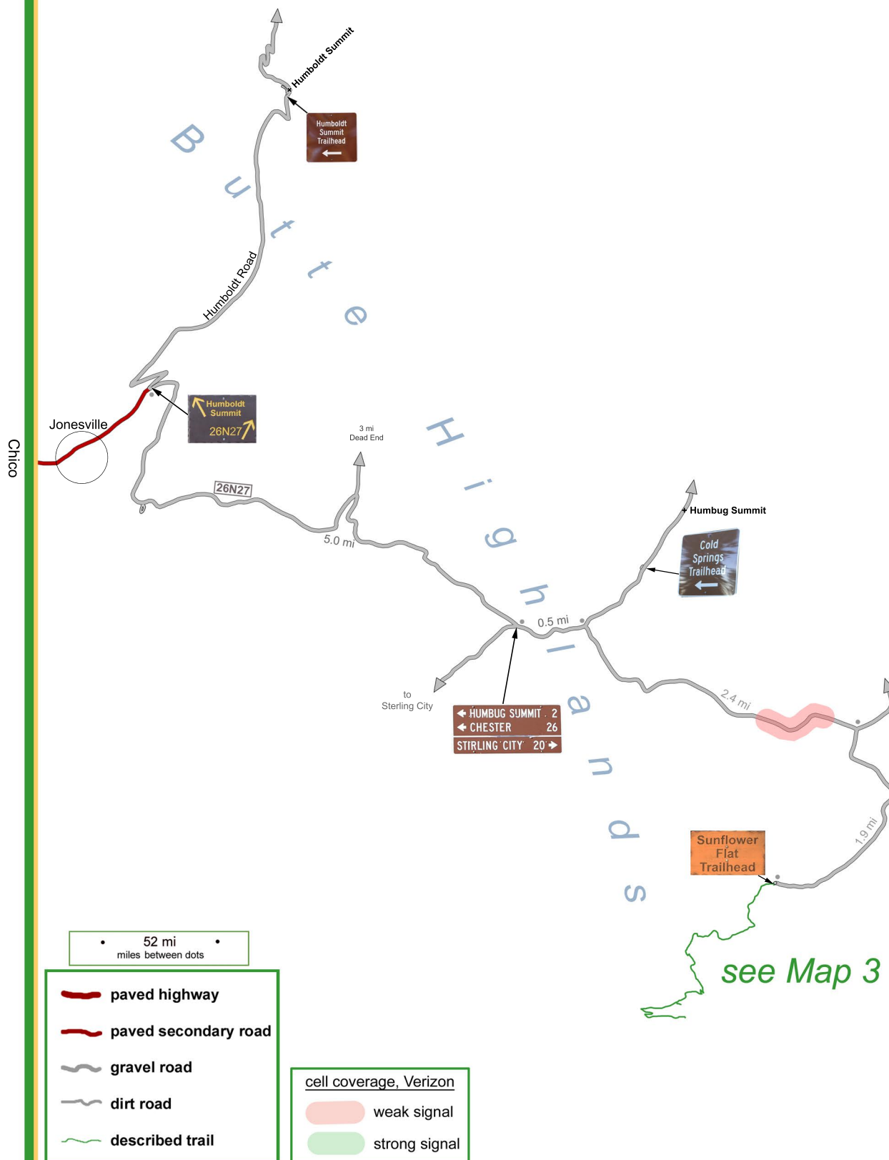
Frog Mountain up-and-back ▪ Map 2 of 3