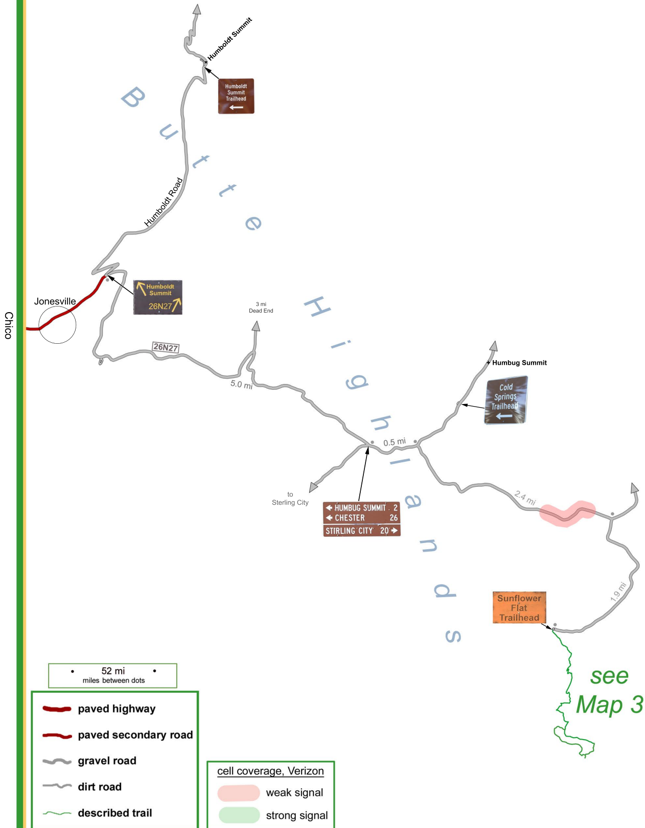
Green Island Lake semi-loop ▪ Map 2 of 3