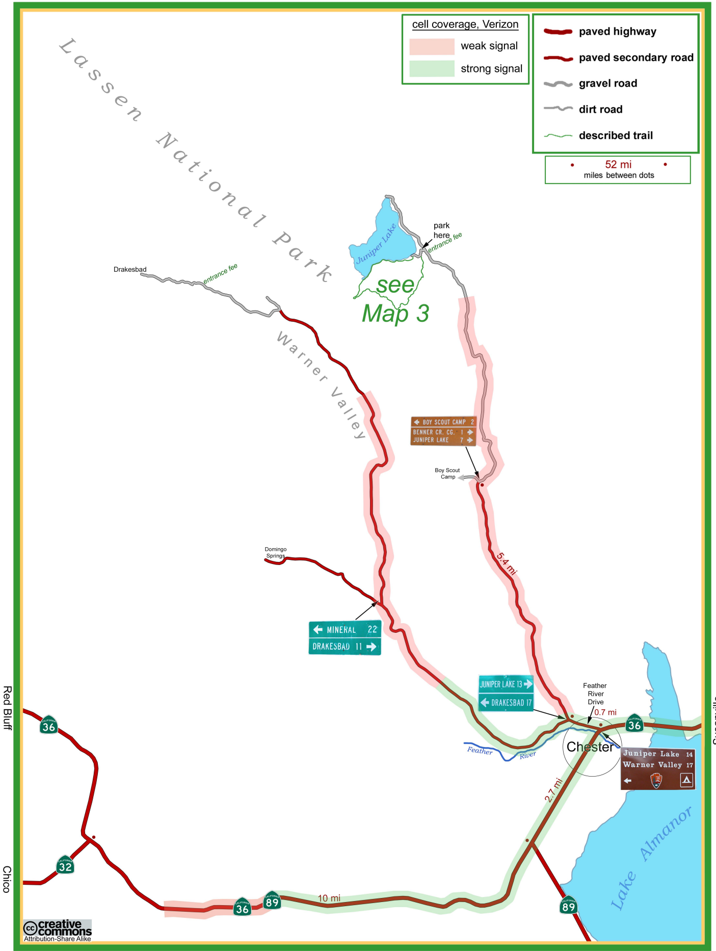
Mount Harkness loop ▪ Map 2 of 3