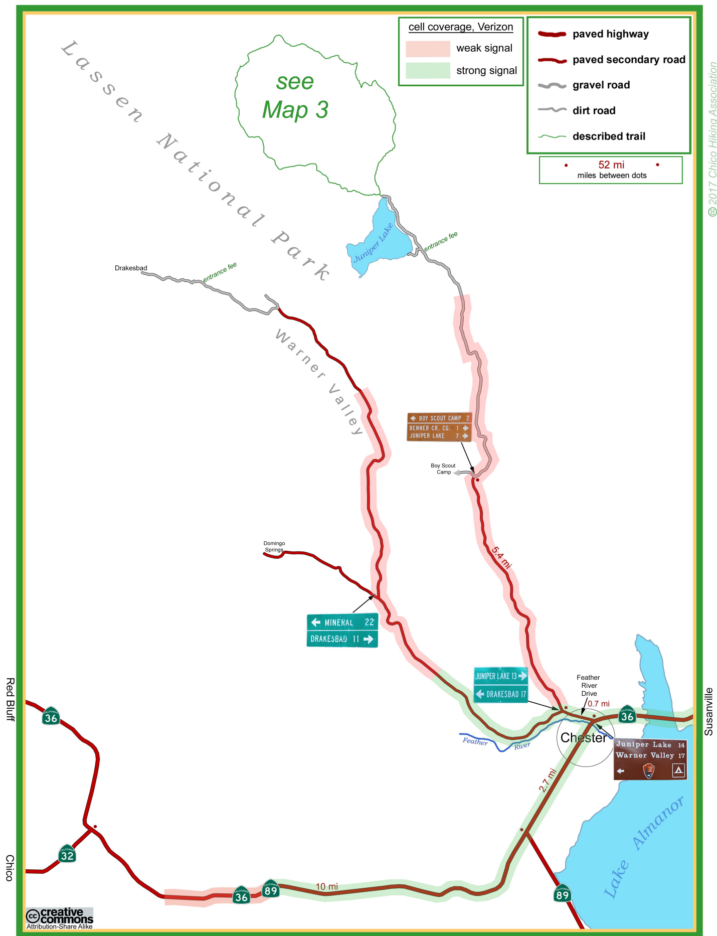
Rainbow Lake loop ▪ Map 2 of 3