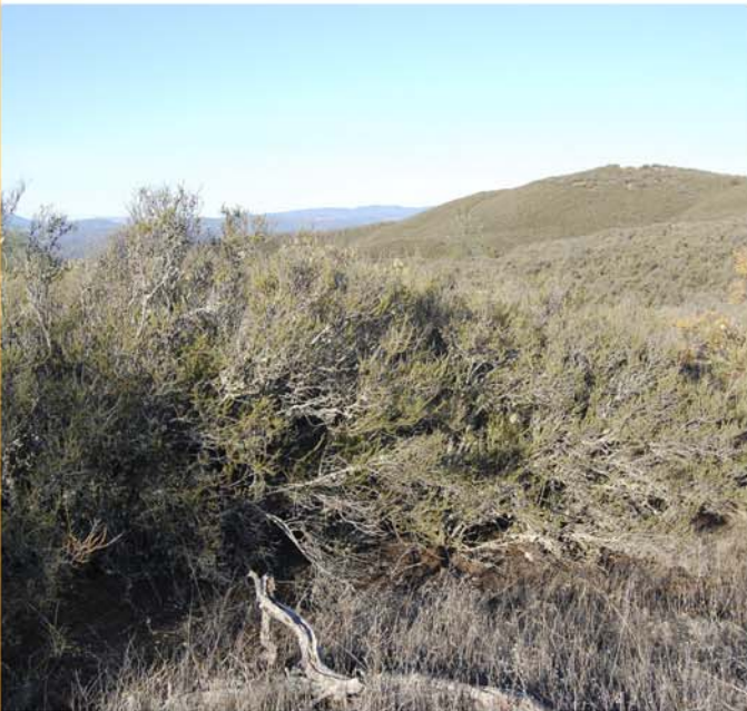
Adenostoma fasciculatum --CHAMISE

Chamise is a common sight along the Pacific Crest Trail in Southern California source: personal observation