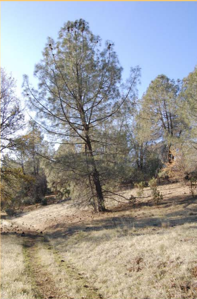
Pinus sabiniana --FOOTHILL or GRAY PINE