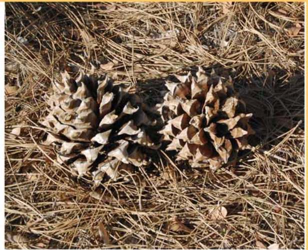
cones of Foothill Pine

Blue Oak and Foothill Pine live only in California (Golden State endemics).