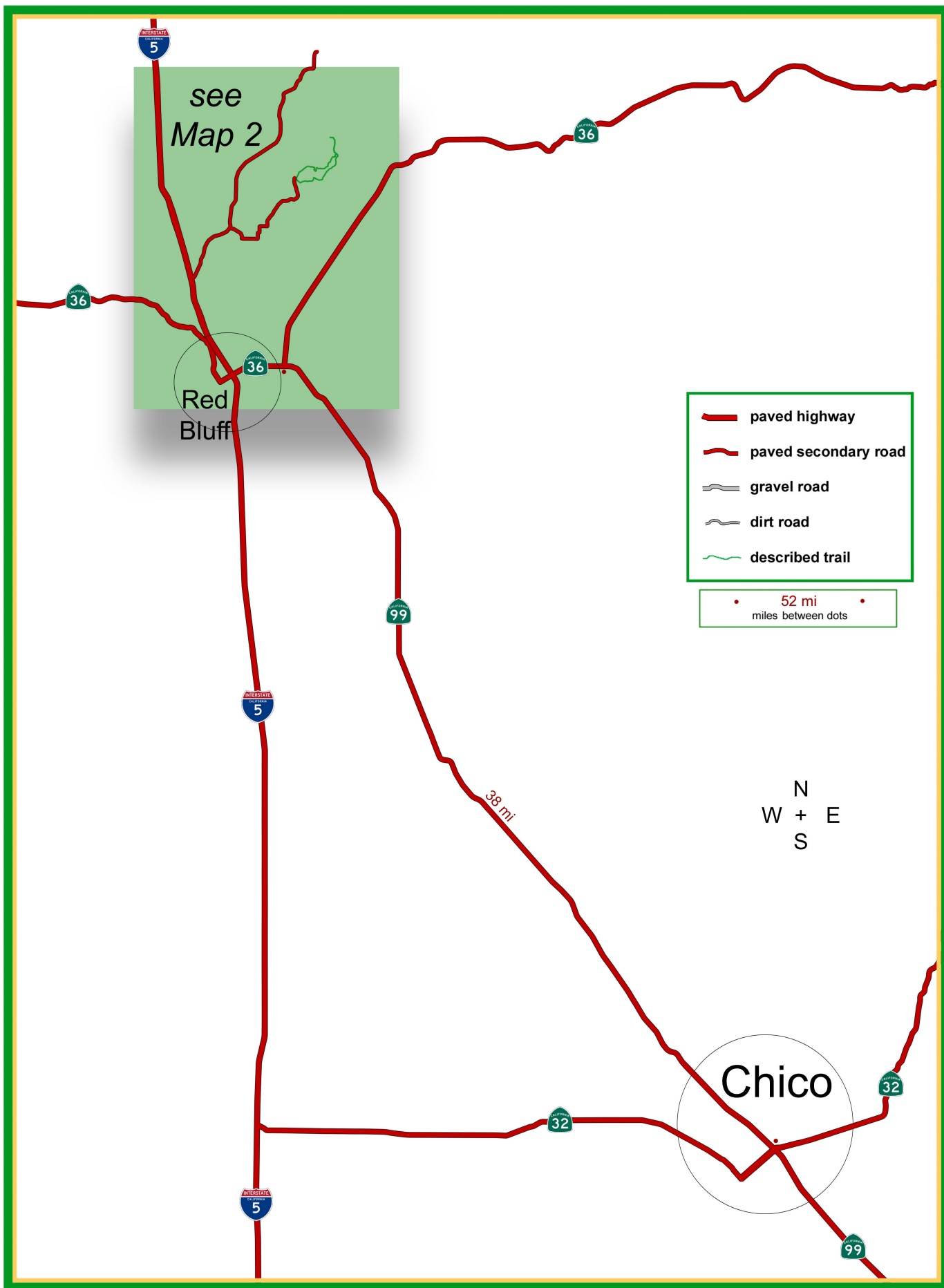
Yana Camp semi-loop ▪ Map 1 of 3

Drive: 1:00 Hike: MODERATE Season: Nov-Apr (hot May-Oct)